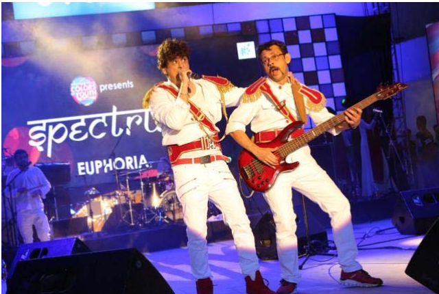
Palash Sen and DJ Bhaduri perform along with their band Euphoria, on day two of IIT Delhi's annual fest Rendezvous (2016).

http://www.hindustantimes.com/music/iit-delhi-s-rendezvous-euphoria-dedicates-performance-to-indian-soldiers/story-I6LBWrMktmDb12KXdZyRN.html