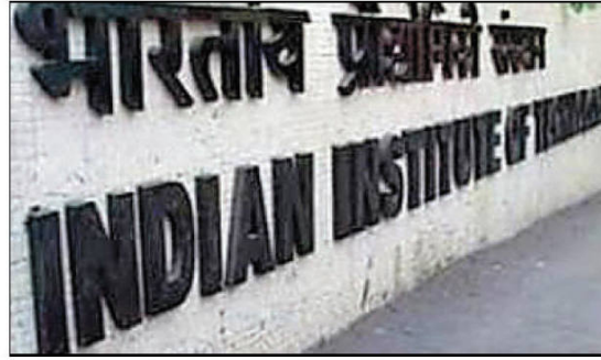
IITs also said they wanted to bring the teacher-student ratio to 1:10

IITs also said they want to bring teacher-student ratio to 1:10 from current 1:15. The HRD ministry has asked them to hire faculty, even fo-