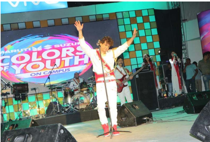
Lead singer of the band Euphoria, Palash Sen, during the performance.

The band was performing for the fourth time at IIT, and Sen didn't mind flattering the IITians apart from making them groove to his music. He said during the performance, "After DU's Lady Shri Ram College for Women, IIT Delhi was the second college to invite us to perform and since then this is our fourth and the maximum number of times we have performed at any college."