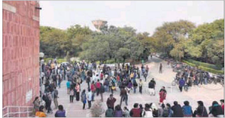
Officials said that more CCTV cameras will come up at the campus to ensure safety of the students in the aftermath of the recent incident.