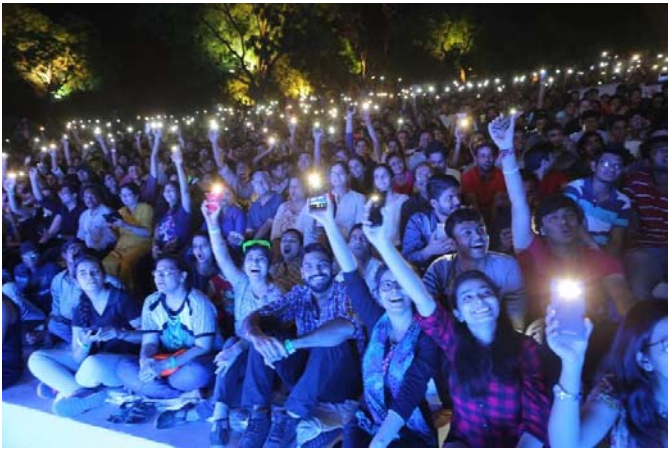
Enthusiastic crowd at IIT Delhi switched on mobile flashlights to ring in the countdown for Euphoria's performance.

this, the wait for the final showdown by Euphoria was made worth by the vocalists of the band TMKC (Teri Music Ki Chahat). With their versions of popular numbers such as Muqabala Muqabala, they kept the crowd entertained.