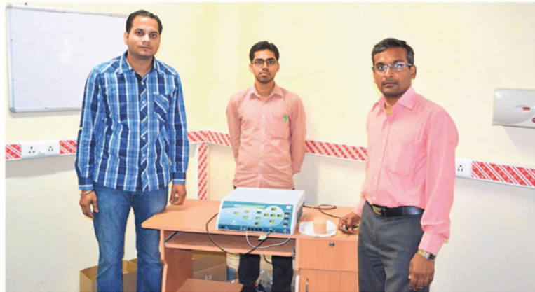
FUTURE FRONTIER: The device, called the Proportional Integrative Derivative system, promises to make breast cancer surgery safer and less invasive. Picture shows the team at IIT-Ropar with the device.

In radiofrequency ablation treatment or RFA, cancerous tissue is burned off by poking a needle electrode through the skin into the tumour. Determining the right places to insert the needle needs high-resolution images of the infected re-