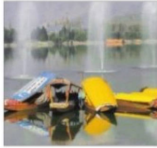
Shikaras on the Dal Lake

The government today informed the Jammu and Kashmir High Court that the vision document for the preservation of the Dal Lake was being prepared by the IIT-Roorkee and would be received by the J&K